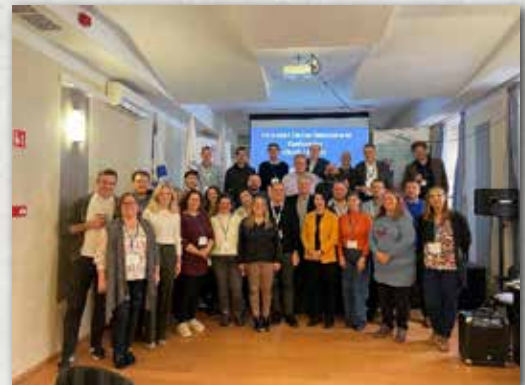
European Federation Leadership conference was attended by thirteen European countries.

The Department maintains ongoing and meaningful contact with the Federations and holds regular meetings with Federation leadership to strengthen their impact in Jewish communities. During the year, events are held with the Federations, along with many different and varied activities. In early November, the first